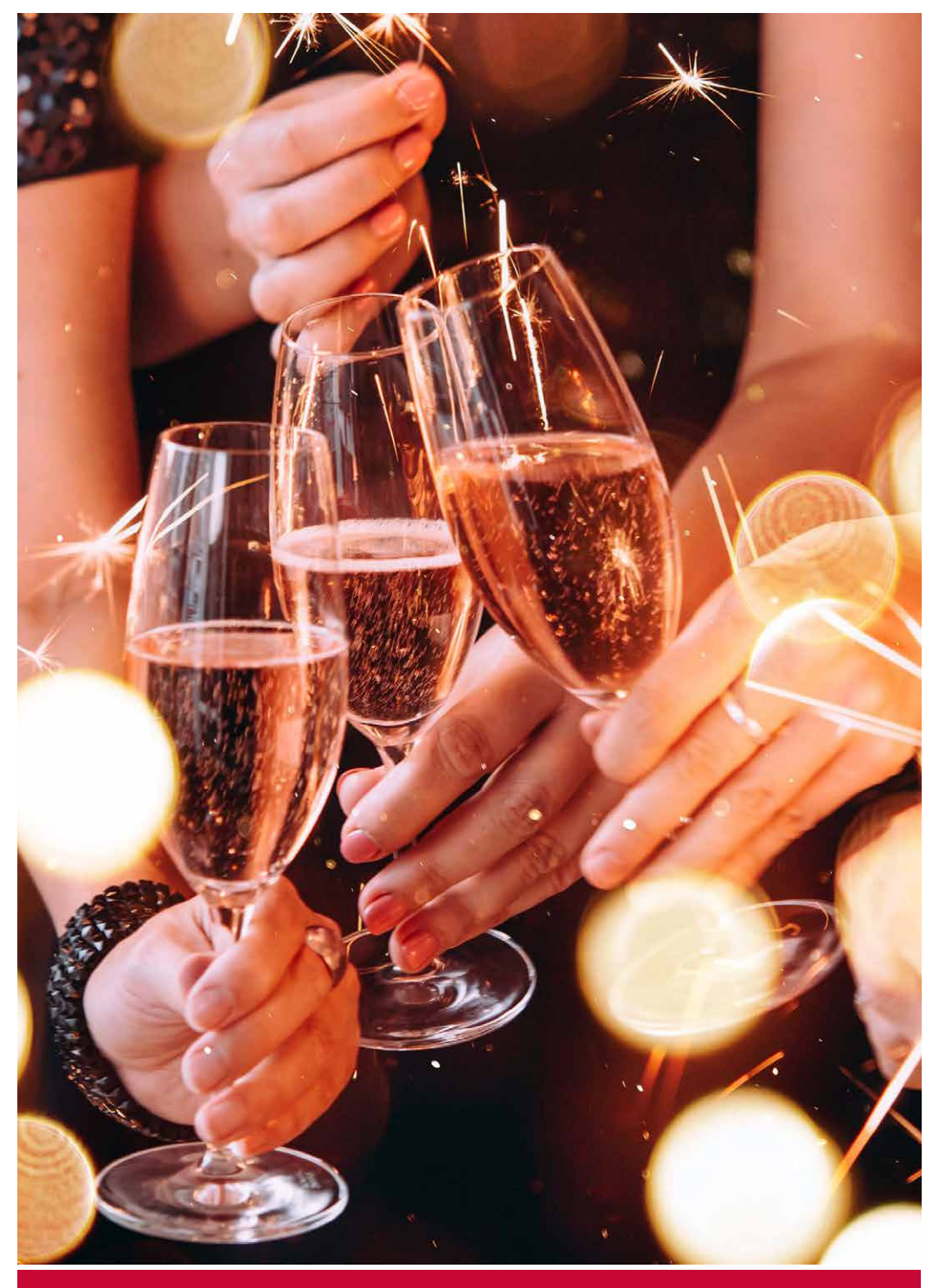
Visit \ \textbf{leonardo-hotels.co.uk/hotels/edinburgh/leonardo-murray field} \ to \ find \ out \ more